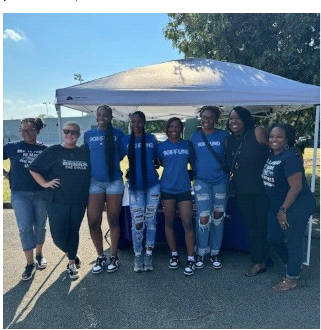
Members of the University of Memphis Women's Basketball team and friends are all smiles after completing a successful event to stress safety in neighborhoods.